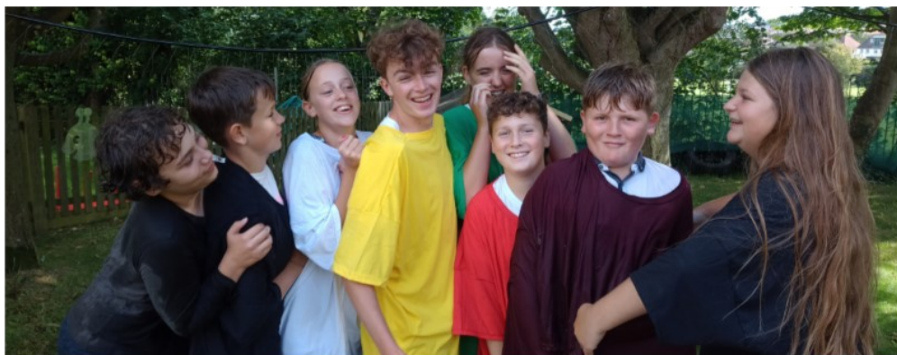
The Tigers - grouping themselves as a burger, frozen t-shirt and all!