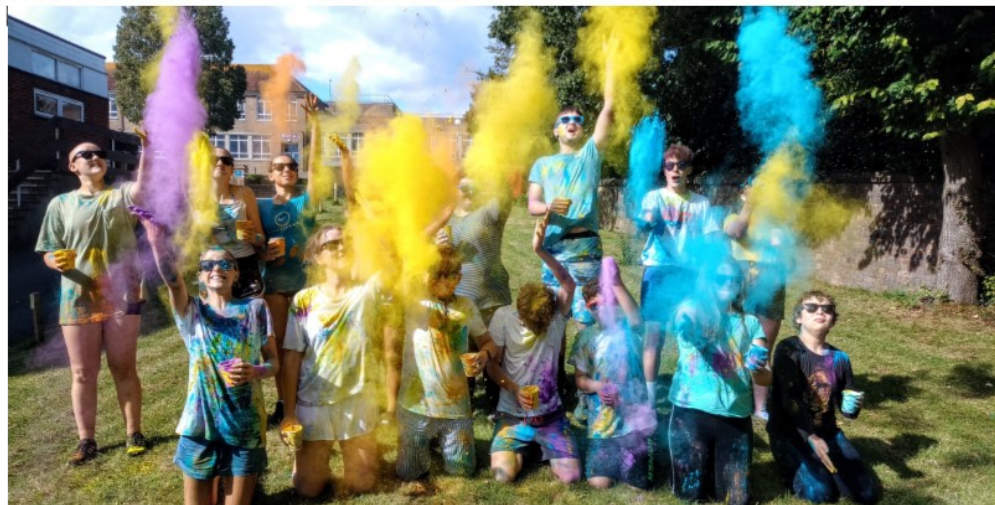
"Let there be colour, and there was colour"