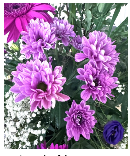
A couple of dates are now available later in August for anyone wishing to donate the flowers. Contact Chris McMahon for details.