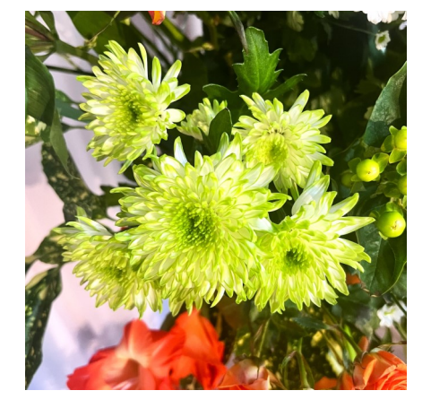
Many thanks to the church for the beautiful flowers and the helpful Bible passage accompanying them. They were very much appreciated. Brian